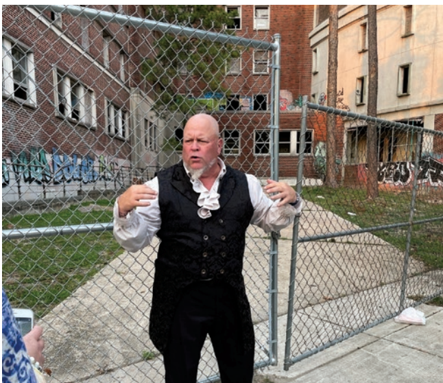
The tour guide for the haunted ghost tour dressed the part

Among the classroom learning and the celebration of new designees, there was also time for venturing out and experiencing all that New Orleans has to offer. On Wednesday evening of the conference, there was a group dinner at Emeril's in the Warehouse District.