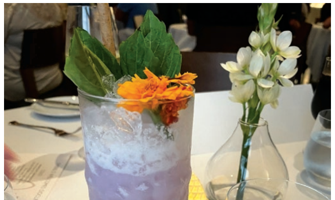
One of the beautiful cocktails served at Emeril's