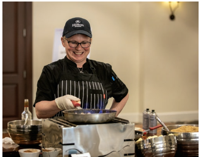
The chef flambés bananas for Bananas Foster