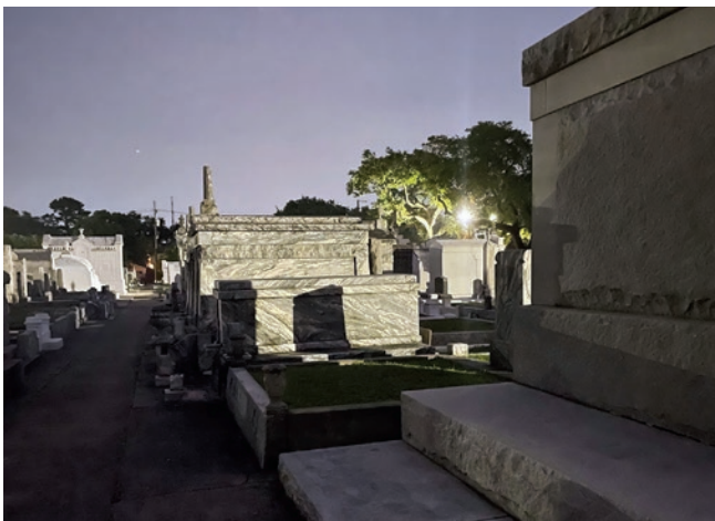
A haunted cemetery stop during the Ghost Tour