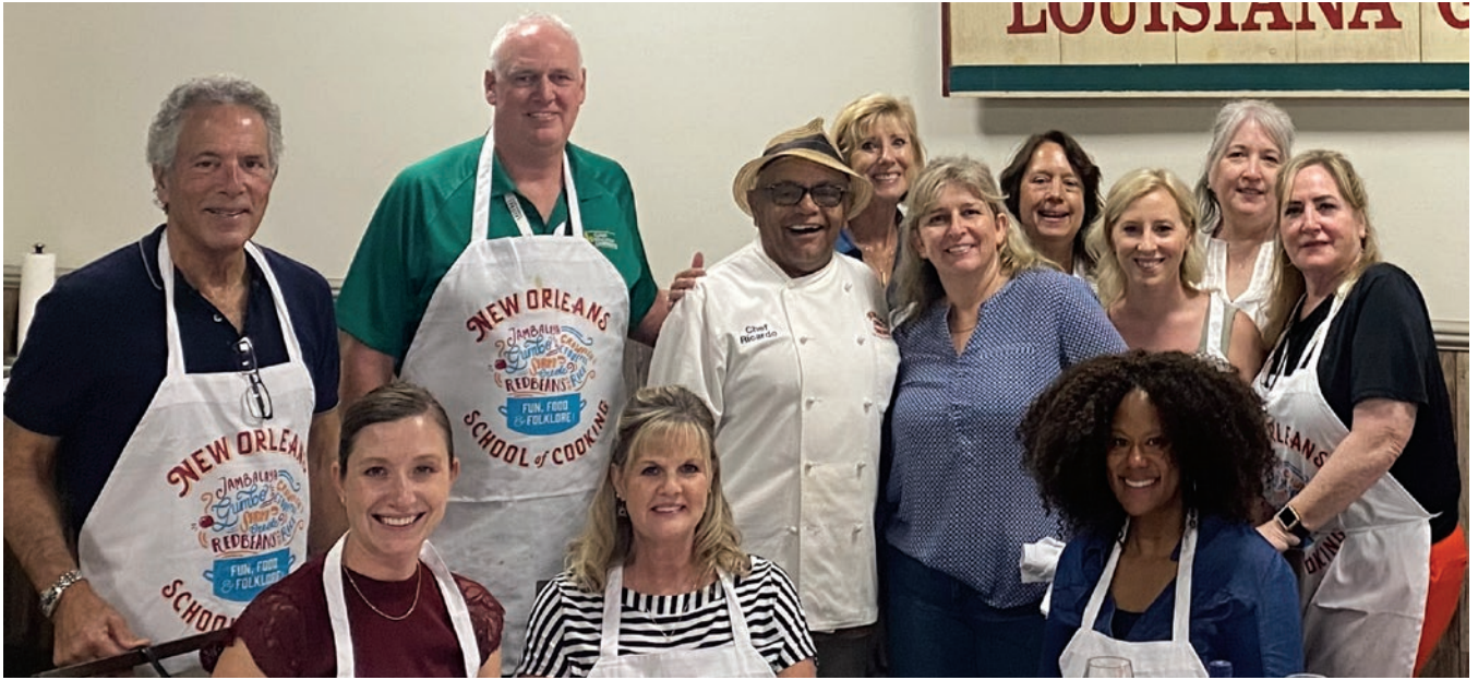
Participants enjoyed cooking a New Orleans style meal at the New Orleans School of Cooking