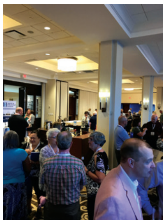
Attendees Socializing at the Opening Reception

For the seventh year in a row, International Insurance Institute, Inc. has joined forces with the American Educational Institute and the Society of Claim Law Associates to host a conference focused on claims education. Much to the delight of the attendees and organizers alike, the conference was held in the Crescent