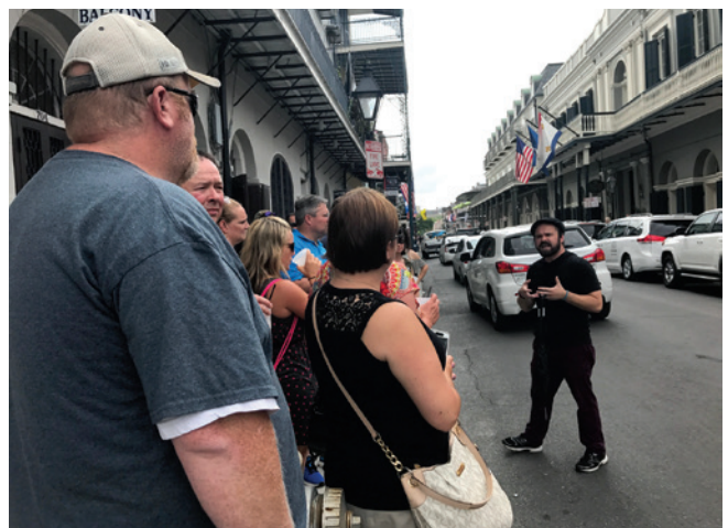
French Quarter Ghost Tour

meal and were able to enjoy the fruits of their labor; golf at the brand new Bayou Oaks golf course in City Park; an afternoon stroll through the French Quarter with a local guide to talk about the grim and ghastly deeds of the olden days complete with a stop at Lafitte's Blacksmith Shop, the reputed oldest bar