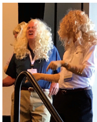
Some Entertainment at the 99-Second Fun Talk

Food is an important part of the culture of New Orleans and the conference organizers wanted to be sure the conference fare reflected those values. Rubber chicken and stale donuts were nowhere to be found. Instead, attendees were delighted by the conference offerings with a New Orleans flair includ-